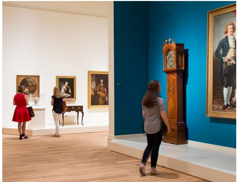
The Gibbes Museum