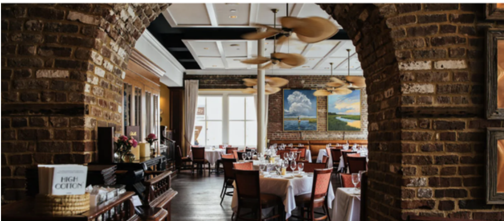
William Gatewood House Above High Cotton Below