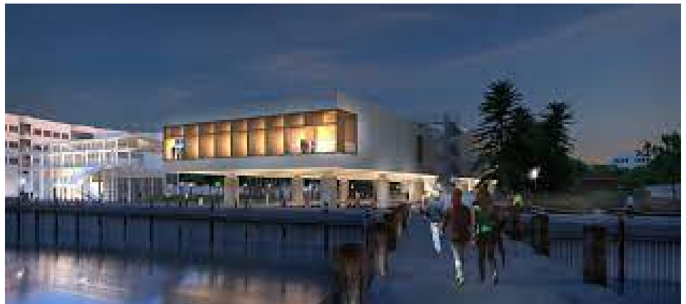
International African American Museum