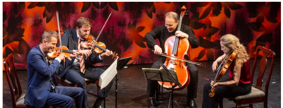
Chamber Music Series, above Planters Inn, left